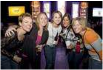
The Rusty Ball